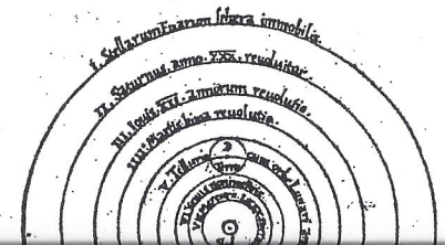
FIGURE 1.11 A copy of the original sketch of his plan for the solar system published by Copernicus note that only the Moon orbits the Earth, while the planets move around the Sun.

thought to be caused by the planets' motion on small circles called epicycles that were centered on their circular orbits. Thus when a planet needed to go backwards, it just traversed the small circle in a direction opposite to that in which the big circle carried it. This complex arrangement may be compared with what happens when the Sun is at the center. Now the retrograde motion of the planet is not real, it is simply the effect seen by an observer on Earth as we overtake the planet in our journey around the